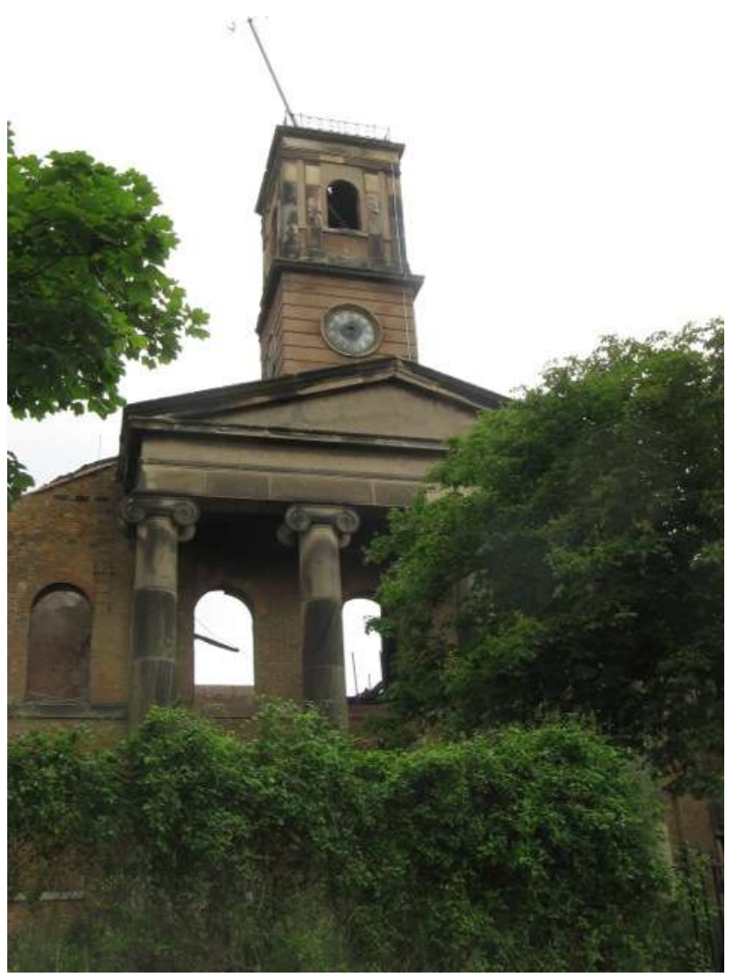
The Church today